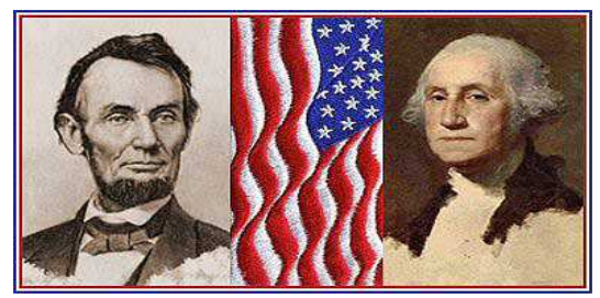
HAPPY PRESIDENTS DAY!